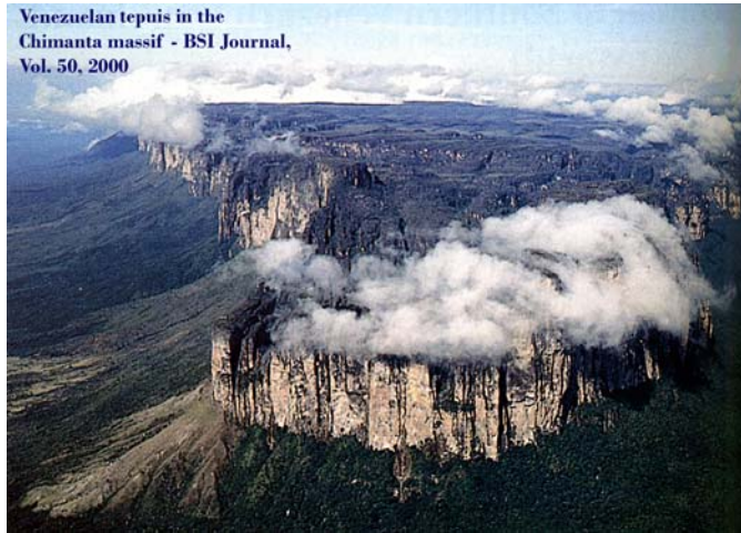
Venezuelan tepuis in the Chimanta massif - BSI Journal, Vol. 50, 2000

mountains in southeastern Venezuela and in Guayana. Tepuis range in altitude from about 2,500 ft. to 7,500 ft. The surface summit of large tepuis have an average area of about 270 square miles. They are covered with fog for many hours and are cool. The average temperature of high tepuis such as Auyan Tepui is 57°F. but it can go as low as 39°F.