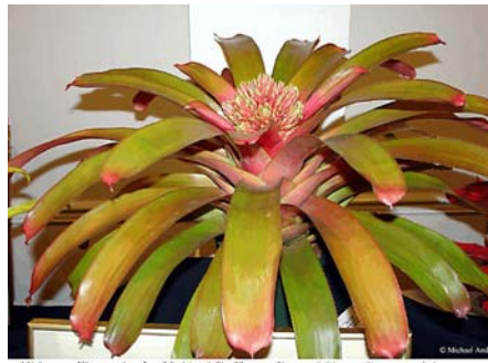
X Niduregelia 'Penumbra' from fcbs.org

X Neomea ( Neoregelia x Aechmea ) evidently is an easy cross to make as it has 34 registered cultivars; many that you'll see in the video have striking leaf colors, but most are unavailable except X Neomea 'Strawberry'. Neoregelia is dominant for size of the blooms in Neomeas. These resemble miniature Aechmea inflorescences with very small or no scapes, and they are low in the cup like the Neos. Because it has dramatic color and tight conformation, my favorite is Nat DeLeon's beautiful cross of Neoregelia 'Royal Flush' x Aechmea fasciata (see photo below). I regret that it was never even registered and is not available.