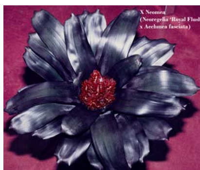
( Neoregelia 'Royal Flush' x Aech. fasciata )