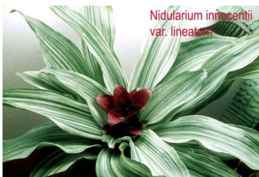
Nidularium innocentii var. lineatum

Judge for yourself when you see most of the foregoing bi-generic cultivars in the video. □