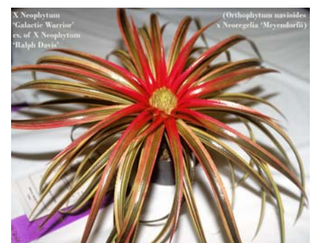
X Neophytum 'Galactic Warrior'