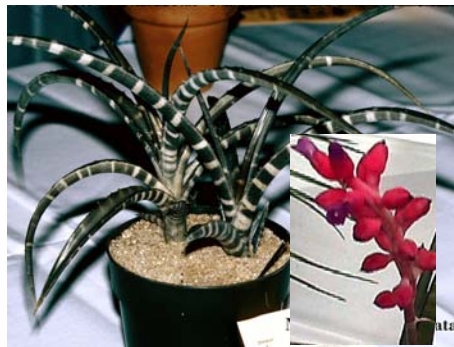
Neoglaziovia variegata - Inflorescence in inset